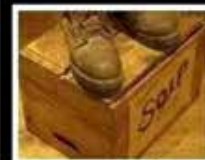
...the soap box,