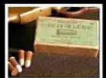
...and the cartridge box.