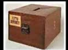
...the ballot box,