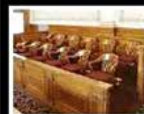
...the jury box,